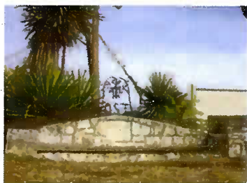
CITY LIMITS 3400 Fredericksburg Rd. @ Vance Jackson San Antonio