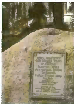
CITY CENTER 100 S. Flores St. @ City Hall San Antonio

1920s Old Spanish Trail Association Directors suggested cities and counties place 0-mile stones at the city center, decorative OST monuments to mark city limits, county lines, and state borders. Restorations of these OST markers are beginning in San Antonio and Bexar County, Texas.