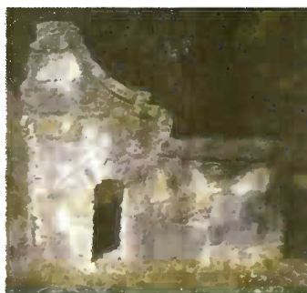
COUNTY LINE 29324 Boerne Stage Rd. @ Balcones Creek Bexar/ Kendall County Line